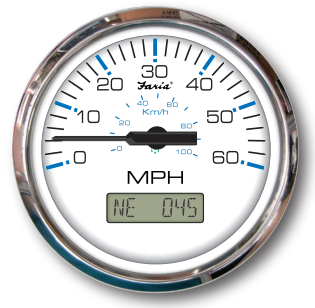
Scale may vary depending on model

Speed data is shown by an analog pointer. This pointer is driven by a digital stepper motor for increased accuracy and minimized pointer bounce during vessel operation.